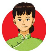
方太太 (Fāng Tàitai)